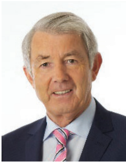
Michael Lowry TD Tipperary