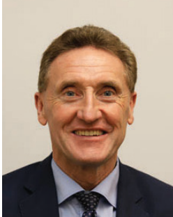
Peter Fitzpatrick TD Louth