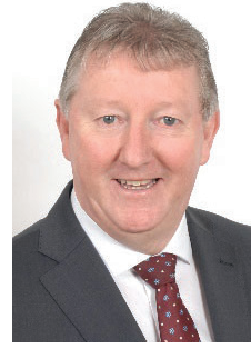
Seán Canney TD Galway East