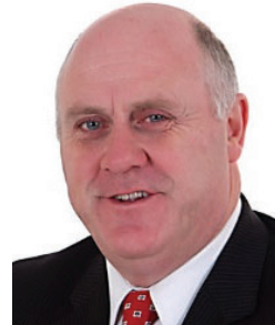
Noel Grealish TD Galway West