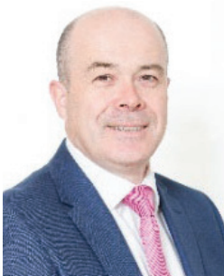
Denis Naughten TD Roscommon-Galway