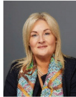
Verona Murphy TD Wexford